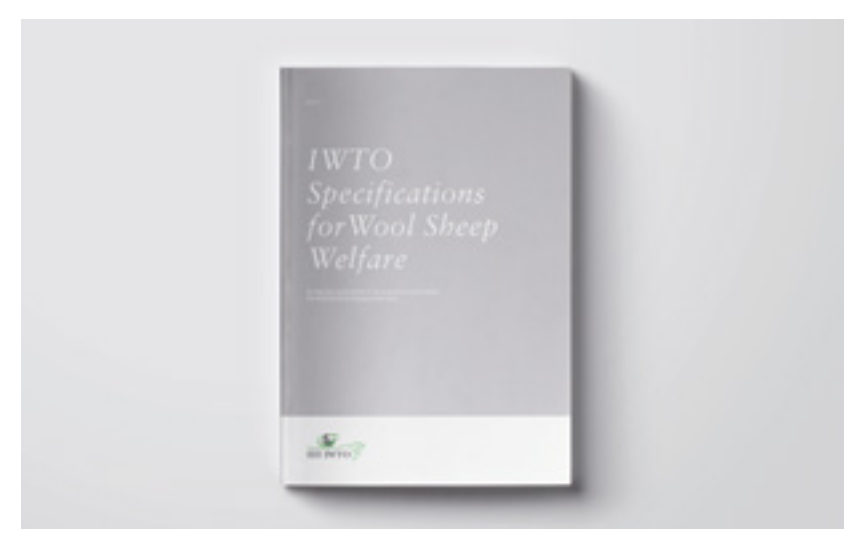
Learn more with the IWTO Specifications for Wool Sheep Welfare, available at www.iwto.org/work/wool-sheep-welfare

Good animal welfare includes disease prevention and appropriate veterinary care, shelter, management and nutrition, a stimulating and safe environment, humane handling and humane slaughter or killing.